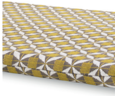
Concrete Seat Pillow