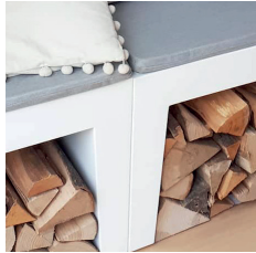
Connect multiple seats together